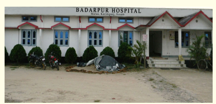
Badarpur Hospital established in 14th October, 2011 (50 bedded) at Badarpur.