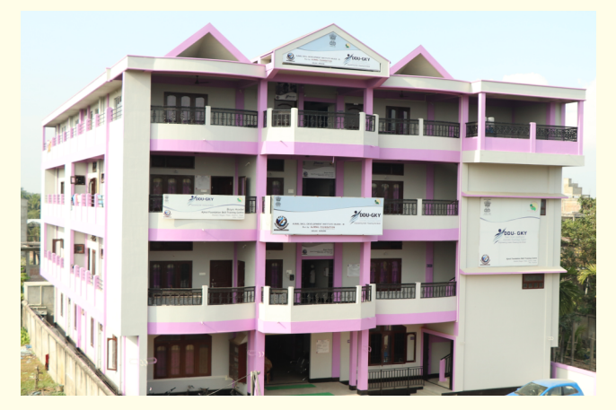
Ajmal Foundation, Hojai stressed on successful implementation of DDU-GKY, skill training and placement project of Ministry of Rural Development, (MoRD), Govt. of India. Under this project, Ajmal

Foundation will provide skill training among 800 unemployed youths from different districts of Assam. The skill training will be imparted on trades like Hospitality, Retail, Banking & Accounting, Bed Side Assistant and Voice BPO (Call Centre). After completion of the 3 months training the trainees will be placed as per the norms of DDU-GKY.