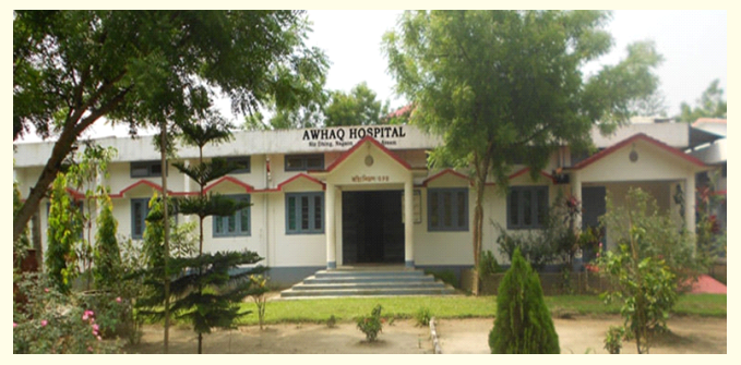
Awhaq Hospital established in 8th Nov. 2010 (30 bedded) at Dhing.